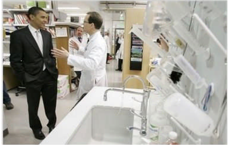
President Elect Barak Obama visited the University of Iowa Cardiovascular Research Lab where he also delivered his first health policy speech.

If you intend to become a leader in academic medicine or biological research are you aware of the University of Iowa Cardiovascular Center Training Program?